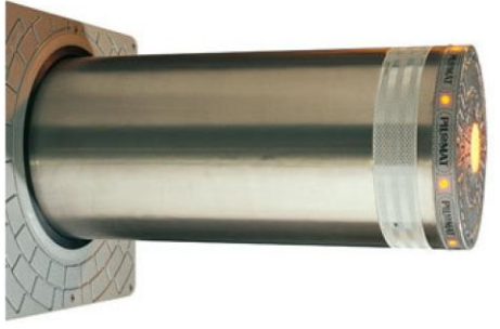
MACS rising bollard type: Pass 275/P800